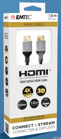
HDMI 4K UHD