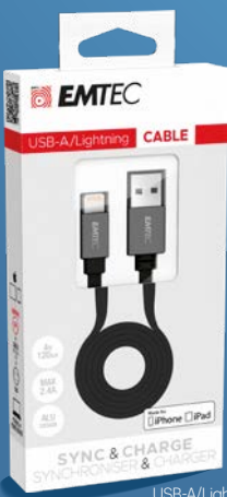
USB-A/Lightning (Apple MFi certified)