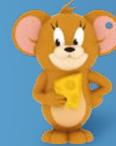
HB103 HANNA BARBERA JERRY