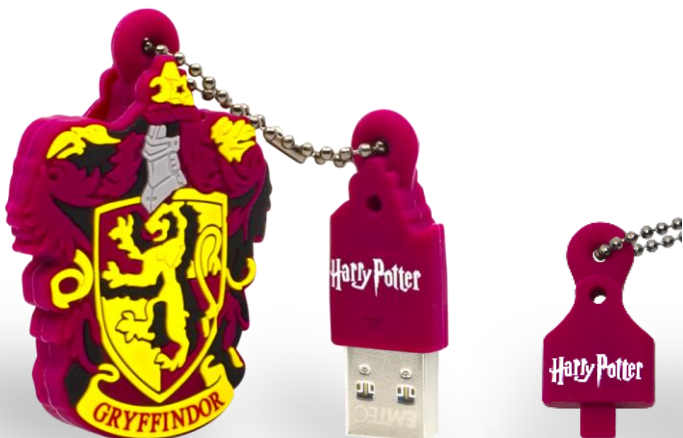
Body / Crest